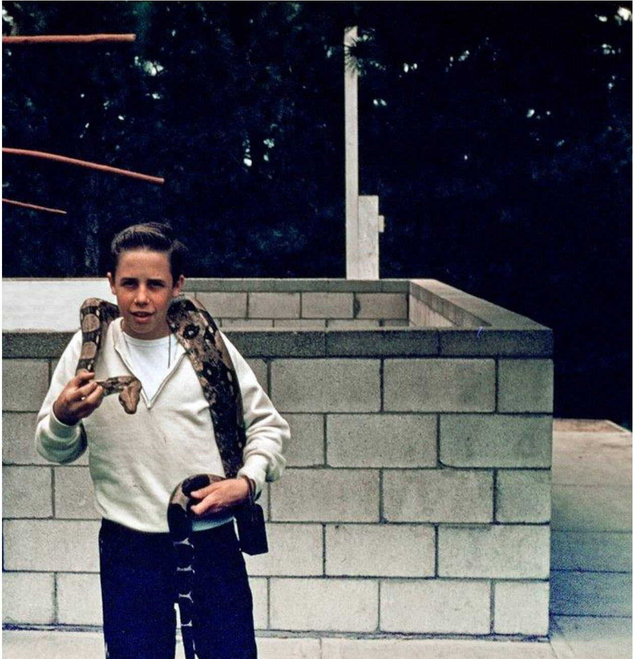
Here I am with a boa constrictor. I was a herpetologist early on and know all about reptiles and amphibians. Mostly I was studying salamanders and frogs.