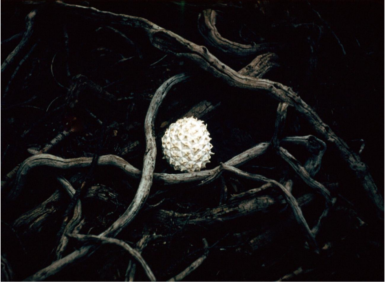
I was already seeking out compositions.