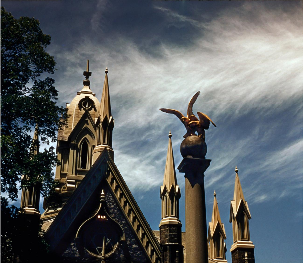
Salt Lake City.