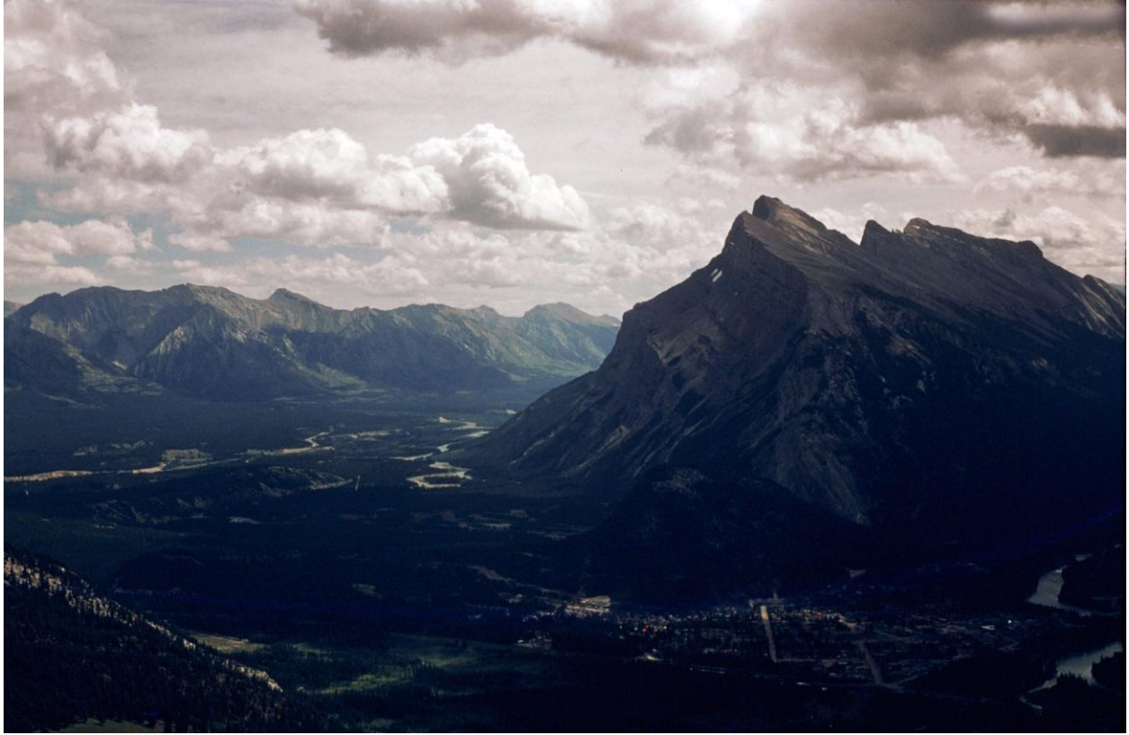
This must be in western Canada.