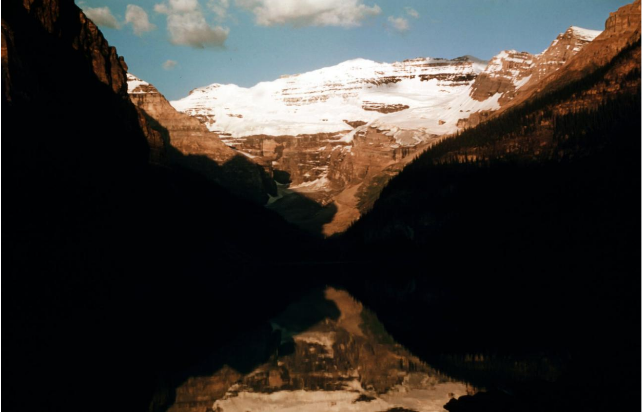
Lake Louisa, Alberta.